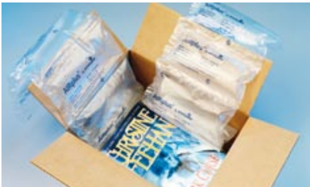
AIRplus® Void Film easily blocks and braces stacked items such as books.