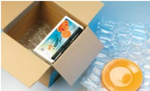
Protect unpackaged china by looping AIRplus® Cushion Film around and between the plates for cushioning.

AIRplus® Cushion Film is an extremely versatile and durable packing product made with the same triple layer film process as Void Film air pillows. Each perforated section of AIRplus® Cushion Film is divided into 16 air chambers making it flexible enough to wrap, bend and fold the film around products for multiple uses and optimum protection.