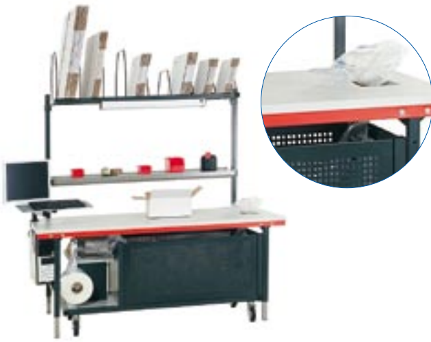
Standard single packing table with AIRplus® Mini feeding inflated Void Film into a convenient dispenser.