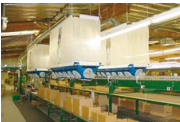
Example of a AIRplus® silo integration.