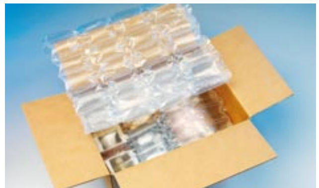
AIRplus® Cushion Film easily wraps around and protects individual unpackaged items such as the candles in this box.