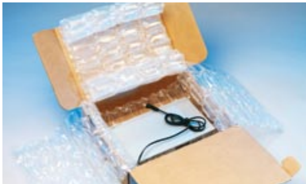
AIRplus® Cushion Film is rolled and positioned around this DVD player giving block and brace protection.