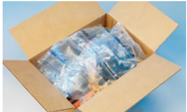
A fast and easy void-fill material, AIRplus® Void Film prevents items like small packages of hardware from shaking open in the box.