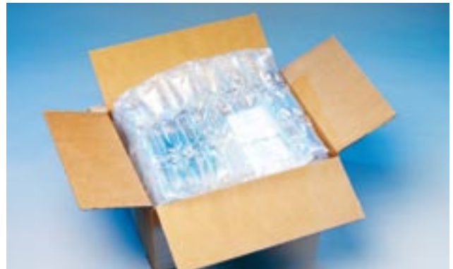
AIRplus® Cushion Film acts as void fill to protect expensive consumer packaging.