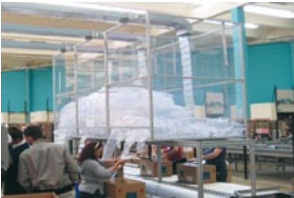
AIRplus® integrated systems continually feed air bags into bins over the packing station for quick and convenient access.