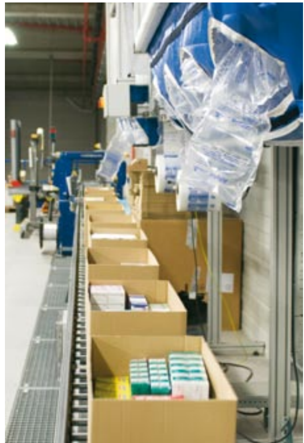
AIRplus® machines keep packing materials readily available by continually filling multiple access storage bins over packing stations.