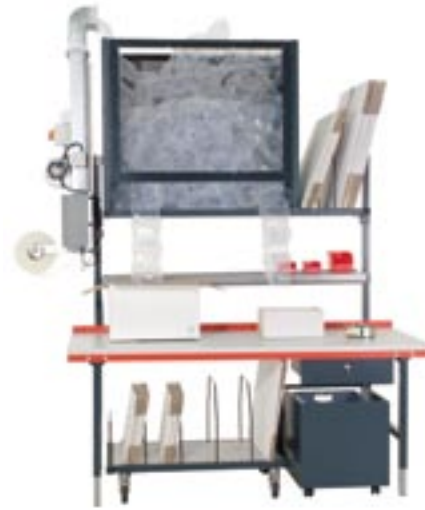
Packaging table with an integrated AIRplus® Mini.