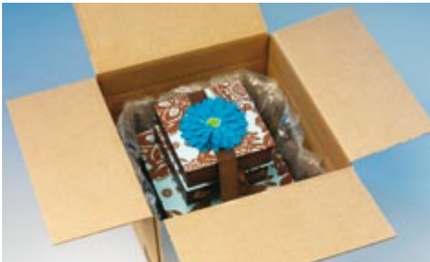
Using AIRplus® Void Film for cushioning protects this gift tower of decorative boxes.

AIRplus® Void Film is created using a triple layer extruded film process to provide durability and reliability. The outer layer provides a non-slip surface to prevent movement in the box, the middle layer helps to hold the air and offers reinforced strength, and the inner layer provides special heat-sealing properties to prevent deflation. AIRplus® Void Film serves as a fast and neat void-fill, a durable block and brace product, and a reliable cushioning material for light- to medium- weight objects.